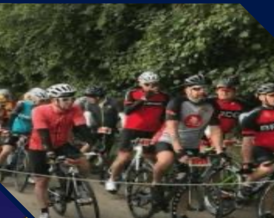
ABF The Soldiers' Charity Bicycle Ride ~ 2017