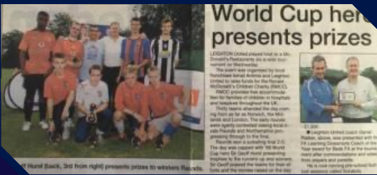
McDonalds 6 A-Side Charity Tournament ~ 2005