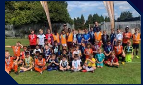
Luton Town FC Community Trust Mini Soccer

We have previously teamed up with Luton Town, Manchester United, Sir Bobby Charlton's Soccer School, MK Dons and Arsenal to offer directed football training and development, and even hosted Dover Down FC at our facilities for an entire year as part of development partnerships.