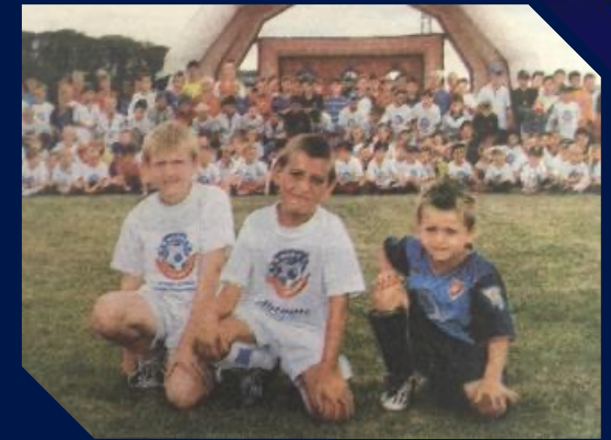
Sir Bobby Charlton Soccer School – International