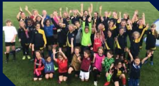
We are continuing to grow our all-girls football teams