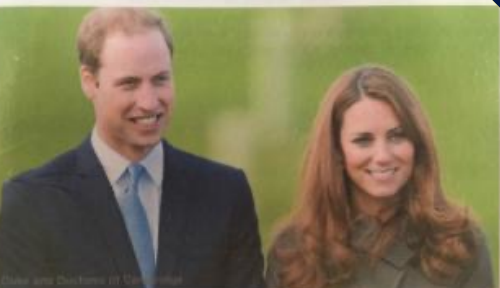
Staff HRH The Duke of Cambridge is to welcome 150 grassroots heroes to Buckingham Palace