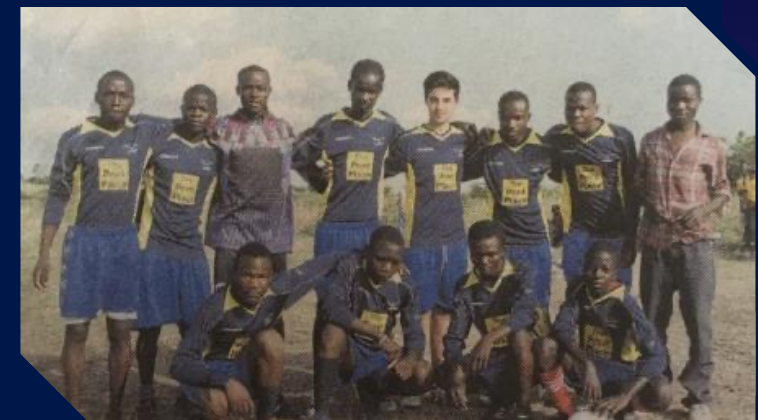
Top – Bottom – Various Photos from Hosted School Events