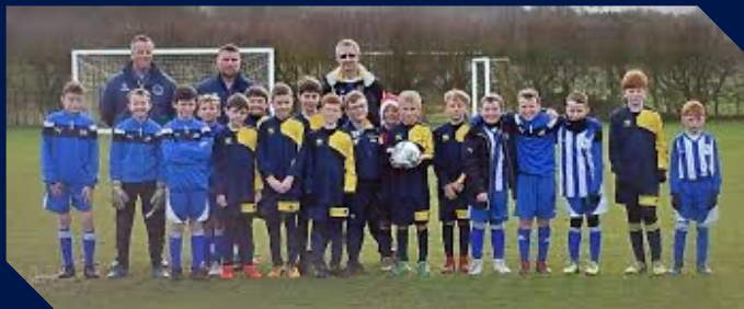
One of our teams receiving the FA's Annual Fair Play Award in 2019